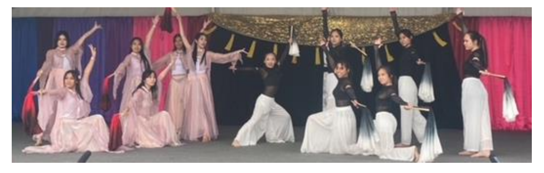
Chinese - 1st place Chinese and 1st for overall choreography on Diversity stage

Samoan - 3rd place Maulu'ulu, 3rd place Sasa, 3rd place Pese, 3<sup>rd</sup> place Exit.