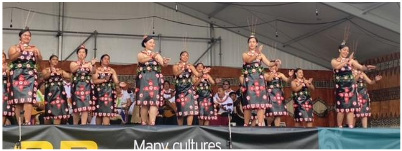
Tongan - 3rd place Tauuluga