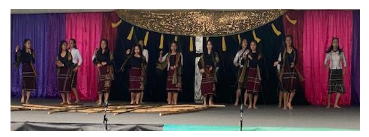
Burmese Group – First ever Burmese group to be represented at Polyfest.